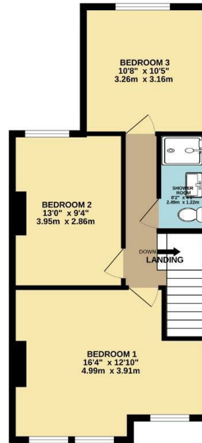
1ST FLOOR 525 sq.ft. (48.8 sq.m.) approx.