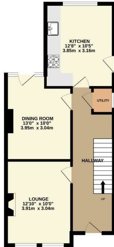
GROUND FLOOR 525 sq.ft. (48.8 sq.m.) approx.